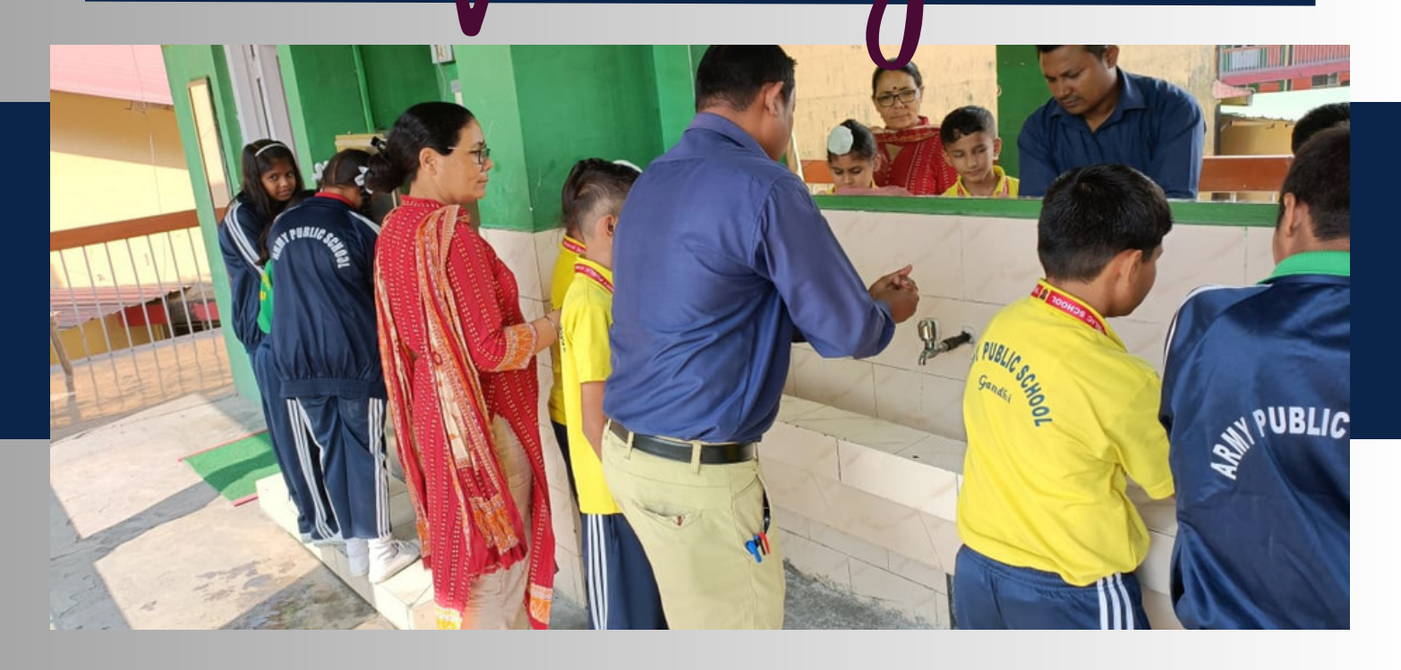
Regular Awareness on Hygiene and Sanitation being instilled among students of Primary Wing of APS Binnaguri.