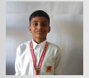
Kotkar Prem II C