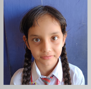
Rijul IV B